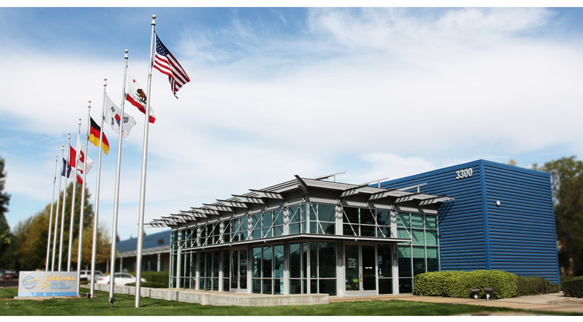
Powered by the fastest molecule on earth!™