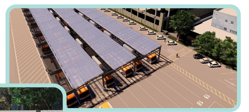
General layout of division charging infrastructure

NCTD's transition to ZEB technologies will require a number of modifications and changes to existing infrastructure and operations.