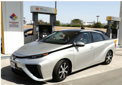
Shell Hydrogen Refueling Station at Torrance, California

Indirect manufacturing overhead costs currently account for up to 30% of current equipment cost. If a station provider produces 15-20 units/year of a single design, equipment cost reduction in excess of 30% can be achieved. This is in addition to benefits of process optimization.